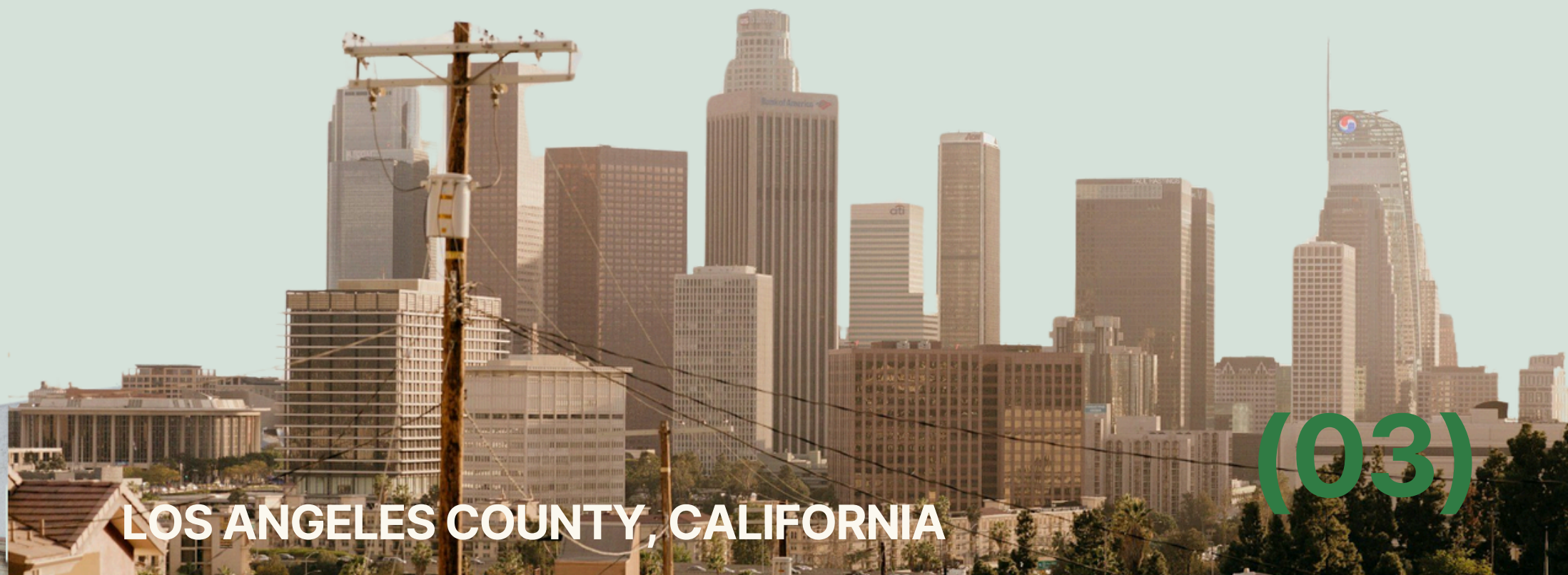
LOS ANGELES COUNTY, CALIFORNIA