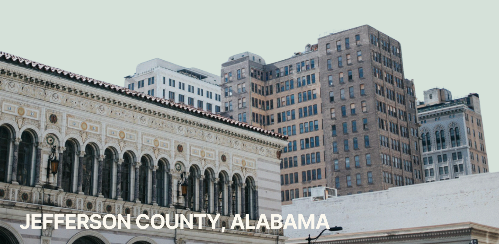
JEFFERSON COUNTY, ALABAMA

Vision: We envision a justice system where judicial decisions are consistently fair, demographic disparities are eliminated, and the public has access to clear information about how courts serve their communities.